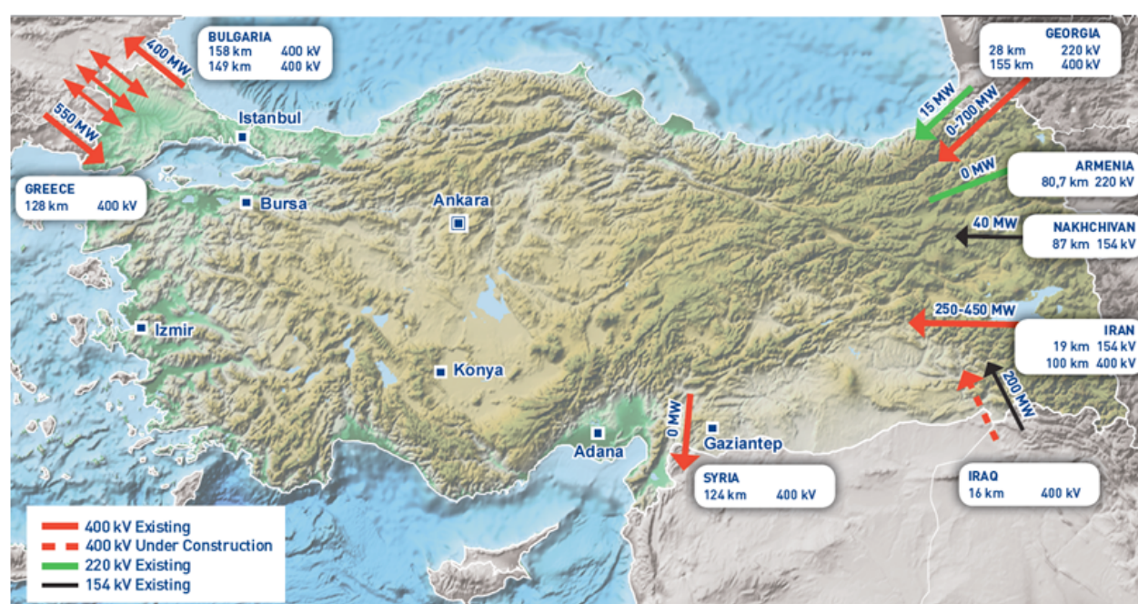
Figure 1 | Turkish electricity transmission system is interconnected with neighbours

Moreover, the transmission system design characteristics and operation principles in Turkey are in accordance with the Transmission System Grid Code Regulation and Electric Transmission System Supply Reliability and Quality Regulation. Both of the regulations and system operation principles are in line with ENTSO-E (European Network of Transmission System Operators for Electricity) best practices. The Turkish system has been synchronously connected to the ENTSO-E system since September 2013. The parallel trial interconnection of the Turkish power grid with the ENTSO-E's Continental European Synchronous Area is in the final stage. It is expected to be fully functional by the end of 2014. Today, Turkey has two tie-lines to Bulgaria and one to Greece. The Turkish electricity system can benefit from the synchronous interconnections with the European platform of ENTSO-E, which will be further developed in the future to increase the cross-border capacity with Europe, and thus improve trading opportunities.