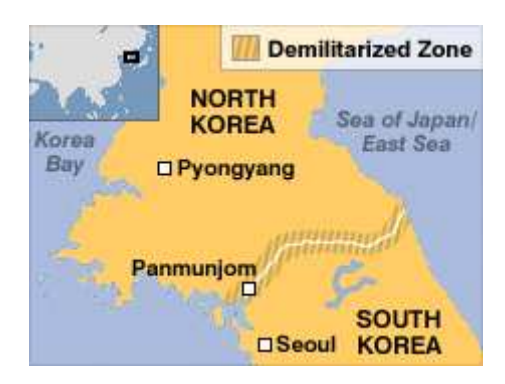
Figure 3. Korean Military Demarcation Line (MDL)

Demarcation Line (MDL), also known as the Armistice line, set in 1953. The MDL runs across 238 km, dividing the two countries.<sup>29</sup> In the village of Panmunjom, bridging between the two, the armistice agreement was signed in 1953. Today it is one of the few zones where Northern and Southern troops directly face each other.<sup>30</sup>