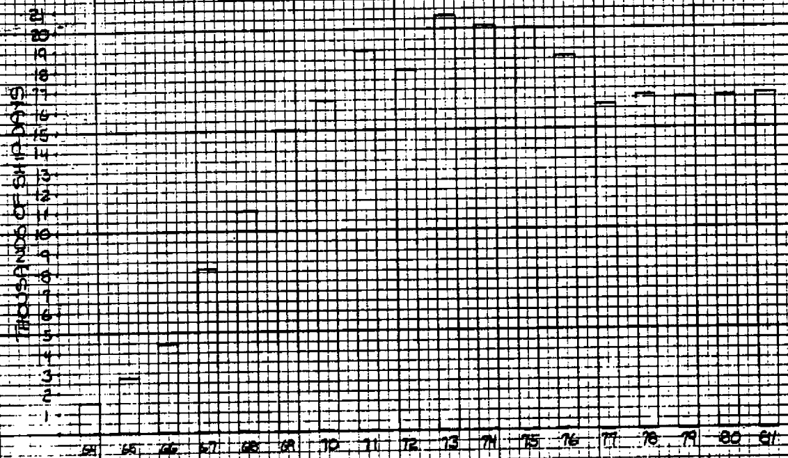
FIGURE 2. SOVIET NAVAL PRESENCE WORLDWIDE: 1964-1981