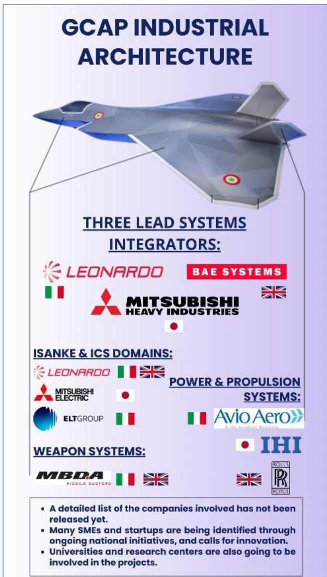
Figure 2 | GCAP industrial partners

lack the resources, personnel and adequate security infrastructures necessary to contribute effectively to a project of this scale. In particular, compliance with higher security standards compared to previous programmes will be a challenge for a large part of the supply chain, which lacks the necessary security clearances and infrastructure to work at higher secret level, and may consider the required investments not worthy of shouldering without adequate financial incentives. On the other hand, SMEs agility and reactivity should complement the reliability and accountability of LSI and LSSI. 29